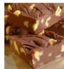
CHOCOLATE WALNUT: a softer, sweeter, more traditional fudge