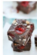
BLACK FOREST: our best-seller, dark chocolate, cherries almonds

All Birthright Fudges* are $5 (each package = 1/4 of an 8 inch square pan).