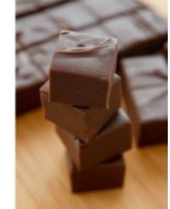
MIDNIGHT MINT: silky dark chocolate with a hint of crème de menthe (no alcohol)