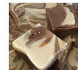
ROOT BEER FLOAT: a very pretty fudge, decadent chocolate with the taste of Root Beer over ice cream!

CHOCOLATE APRICOTS: 6 hand-dipped, dried Apricots. A tarter taste for those who like their chocolate less rich. $3