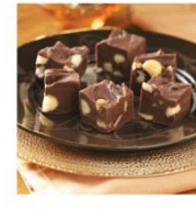
MACADAMIA MADNESS: dark chocolate, macadamias (a bit smaller size as the nuts are pricey) limited quantities