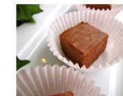
CLASSIC CHOCOLATE: softer, sweeter, more traditional, (no nuts but prepared in a home kitchen ~ trace amounts may be present)